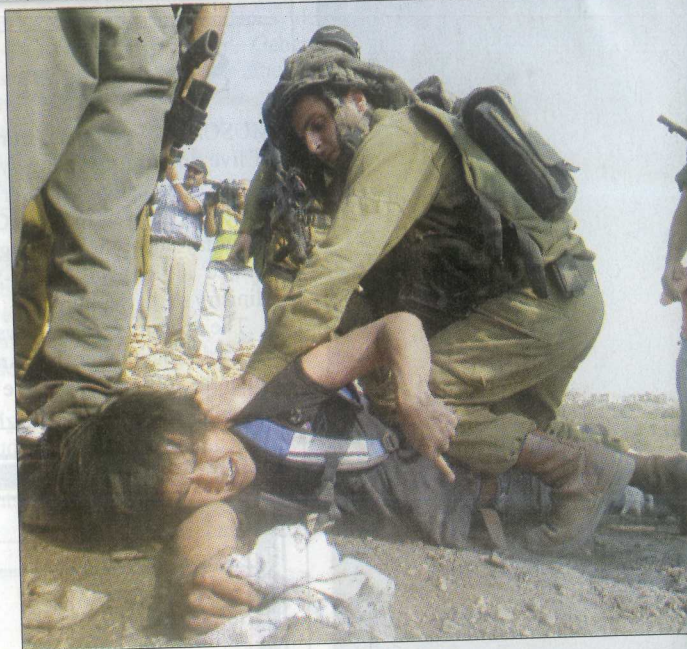
ISRAELI soldiers clash with Palestinian and Israeli demonstration against Jewish settlements in the West Bank village of Beit Omar